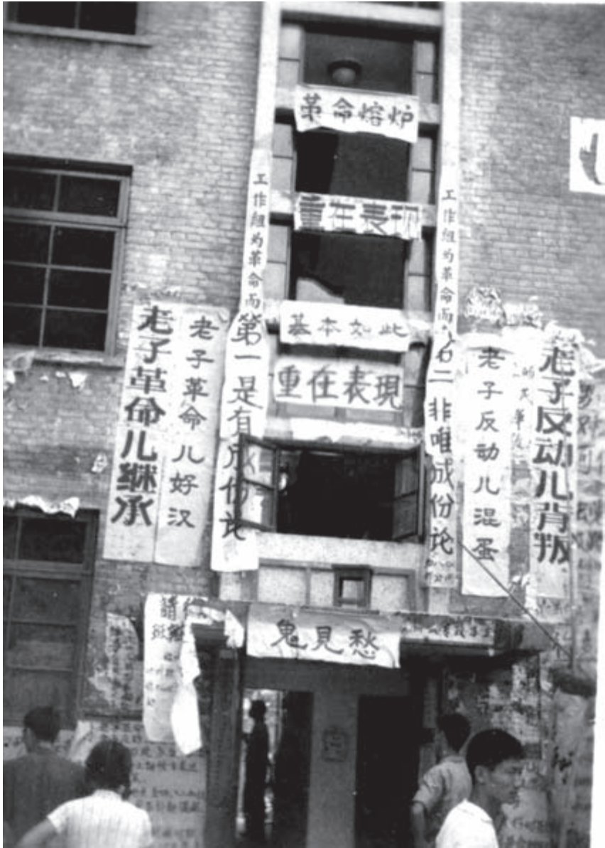
Figure 2. The war of couplets: couplets ( duilian ) containing conflicting or opposing political messages over the issue of family class origins on a Tsinghua University dormitory building, August/September 1966.